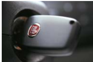
► Anti-theft engine immobiliser with rolling code